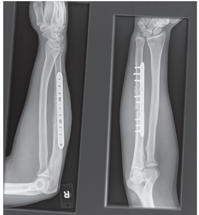
Fig. 2 X-rays show revision of a non-united fracture.

metal work failure. Only one patient was reported to develop metal work irritation from a DCP plate and required a metal work removal after 6 months. The average number of hospital visits was 4 (ranged from 4 to 6 visits).