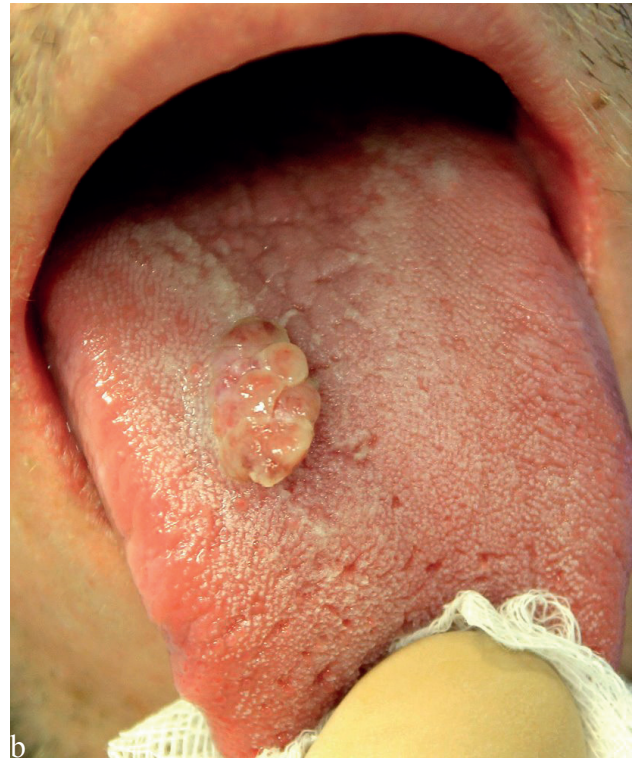
Fig. 2: Typical form of the Kaposi sarcoma of the gingiva (a) and an atypical exophytic form of the tongue tumor (b).

The most common diagnoses were chronic form of the plaque-induced gingivitis in 23 patients (79.3%), pulp necrosis in 16 patients (55.2%), tooth decay in 16 patients (55.2%), pulpitis in four patients (13.8%), and apical periodontitis in two patients (6.9%). Only 7 patients (24.1%) revealed one type of oral mucosal lesions, one of them (3.45%) with two types of various mucosal le-