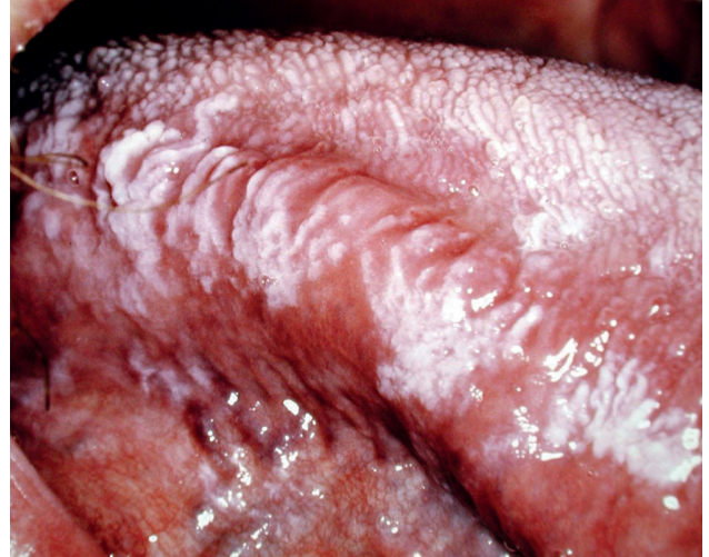
Fig. 3: Hairy leukoplakia, a chronic viral infection caused by Epstein-Barr virus, known for 40 years in the association with HIV.