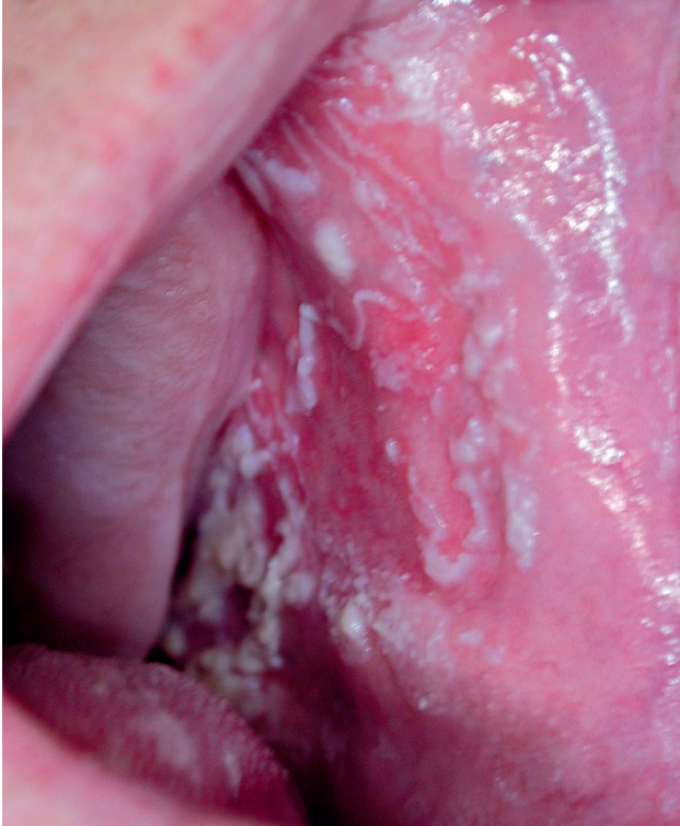
Fig. 1: Acute pseudomembranous form of the oral candidiasis of the buccal mucosa. Typical white lesions combined with redness in surroundings.