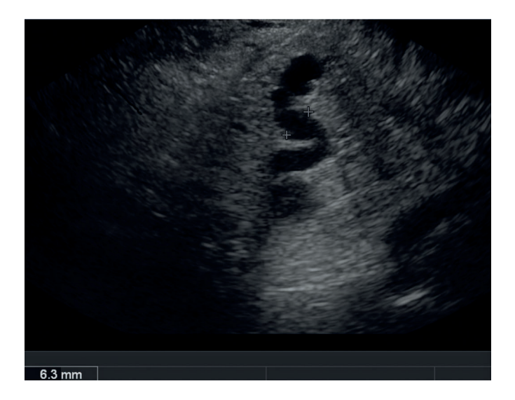
Fig. 3 Pancreatic adenocarcinoma of the uncinate process causing dilatation of the pancreatic duct to 6.3 mm in the neck of the pancreas.

subsequent surgery, as long as the shortest possible stent is used. However, artefact from metal stents can impair visualisation during EUS and make it difficult to perform targeted needle aspiration especially in small lesions. In view of this, operators prefer performing EUS before stent insertion. However, this is not always possible due to limited availability of EUS as compared to ERCP, which is more widely practiced. Ideally, tumour staging and tissue acquisition by EUS should be followed immediately by either ERCP or EUS guided biliary drainage within the same session, if such a facility is available. If a diagnosis of malignancy is less certain, initial drainage of biliary obstruction with plastic stent is a reasonable option, which can be changed to a metal stent at a later date.